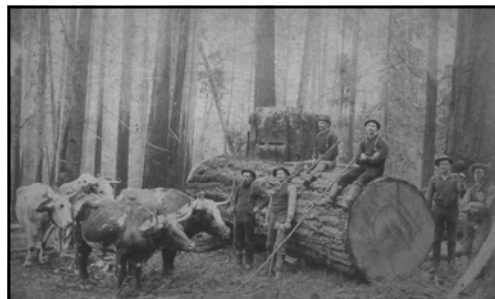
Loggers with ox team.