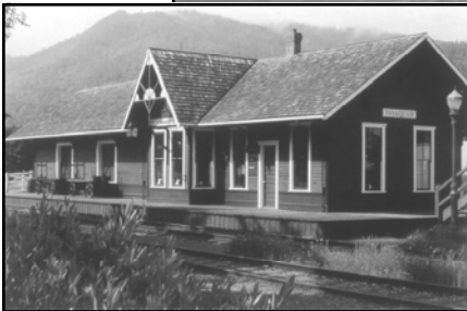
Left: Issaquah Depot, built in 1889.

Now over 75 organizations strong, with the added support of 74 individual members, AKCHO continues to provide a meeting place of ideas and a forum for the issues that confront museums and heritage groups. More than stewards of the past, AKCHO's members are a vibrant group assuring a place for preservation in the future. AKCHO facilitates the communication, professional standards, and funding of heritage groups.