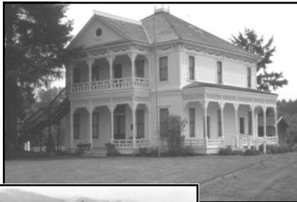
Right: Neely Mansion, Green River Valley, built in 1894.

AKCHO was incorporated in 1977 as a forum available to all who work in the world of heritage preservation. Volunteers, preservation professionals, developers, and communities took new pride in the heritage landscape and many new community heritage groups found homes in the lovely mansions, depots, churches, public halls, and commercial buildings rescued from an uncertain future.