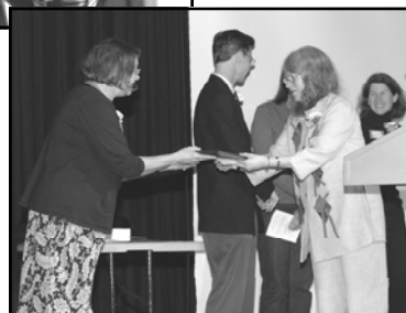
Right: AKCHO Awards ceremony, April 2008.

"The approach to learning about the past promoted by local historic preservation groups strengthens our students' ability to participate in our democracy."