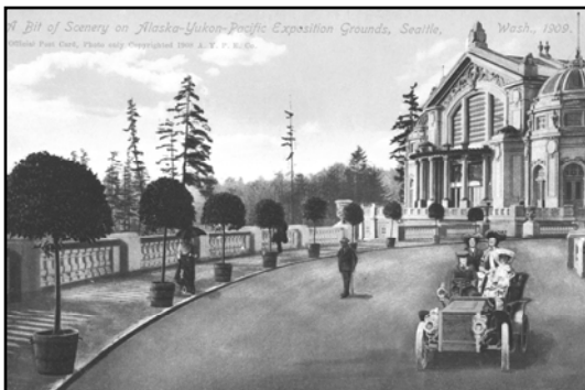
Official postcard, Alaska-Yukon-Pacific Exposition, 1909.

King County's history museums and heritage organizations exist to preserve, show, and tell what has happened in the past. They give us pride of place. In many of our towns, the historical museum is the only cultural center in the community.